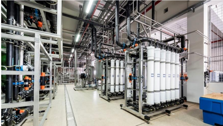
Image: A recycling plant for vapour condensate saves fresh water for a dairy and reduces the pressure on its wastewater treatment plant.

Treatment can be useful for quantities as low as 25 cubic meters of vapour condensate per hour. Where prices for fresh water or wastewater are particularly high, the process can be cost-effective from just 10 cubic meters per hour. Experts from EnviroChemie examine this on a case-by-case basis.