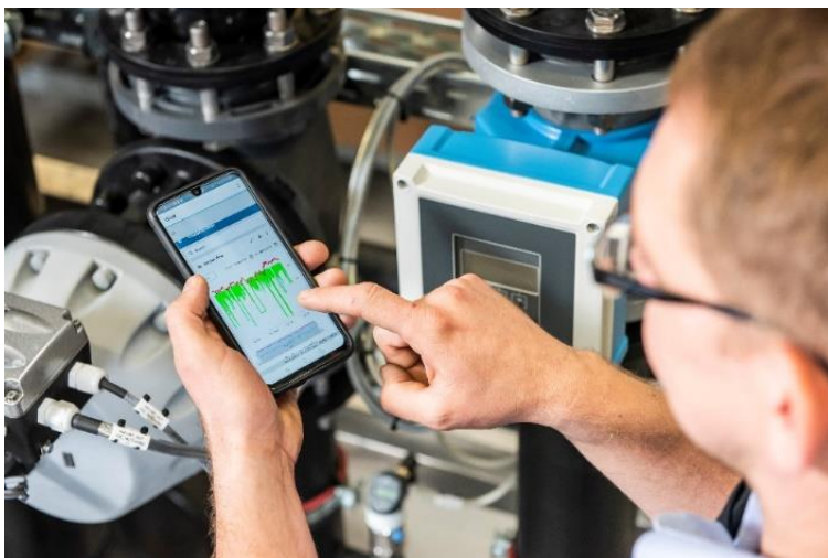
Fig.: EnviroChemie's WaterExpert digital service platform simplifies plant operation and makes recommendations for plant optimisation.

Production facilities today often face the question of how to deal with ever greater water shortages and the transition to alternative energies. Where needed, EnviroChemie's experts consider the entire water processing system and determine potential for improvement. It may be possible to recycle water substreams such as vapour condensates for reuse in production. Depending on the application, changes to process technology may allow biogas to be produced, thus reducing the need for fossil fuels. Optimising or modernising plant components can reduce power consumption significantly. The use of digital tools like WaterExpert simplifies plant operation and delivers a constant stream of data as the basis for further plant optimisation. Operating costs can then be decreased even further. The plant's carbon and water footprints can also be reduced.