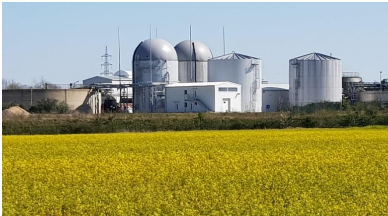
Image: EnviroChemie operates the water processing plants for a potato processor and has reduced its consumption of power, fossil fuels and fresh water in multiple optimisation phases.

Water recycling, optimised power consumption and biogas production have reduced CO 2 emissions and the water footprint. In addition, the consumption of primary energy for steam generation has been lowered.